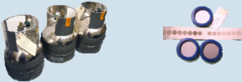
AMP staff collect air samples in air tight containers or by using air filters.

AMP staff use special equipment to carefully collect and test the air samples, determining the concentration of pollutants in these air samples.