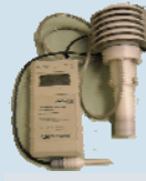
Field audit equipment

The field equipment also undergoes rigorous testing, calibration and maintenance.